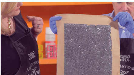
Pulling away from you, remove kraft paper