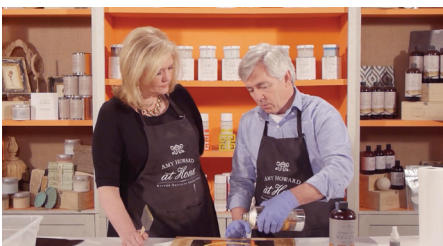
Apply second coat of mirror stripper