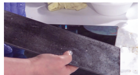
Rinse with water / paint the back