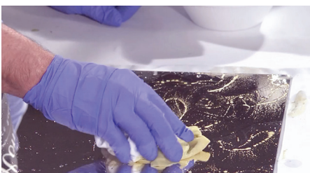
Apply mirror solution