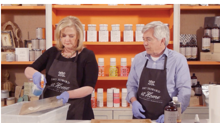
Rinse with degreaser / water