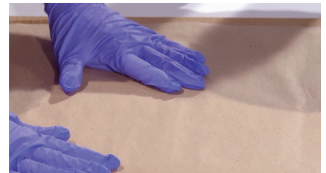
Press kraft paper down onto mirror