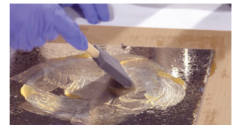
Second coat of mirror stripper