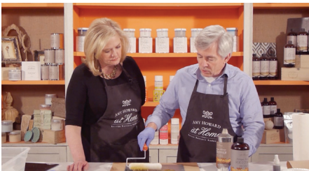
Apply mirror stripper with foam roller